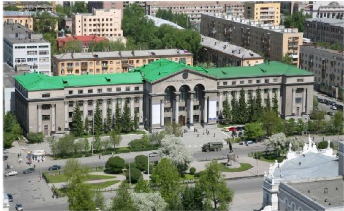
UrFU building in the central part of the city

To make a further step to a global scale, an interdisciplinary Master's Degree programme and a Summer School was implemented, under the name of Russian Studies in Real Russia .