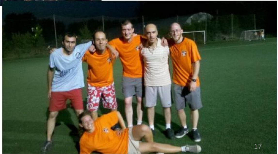
After the football match with locals (2011)