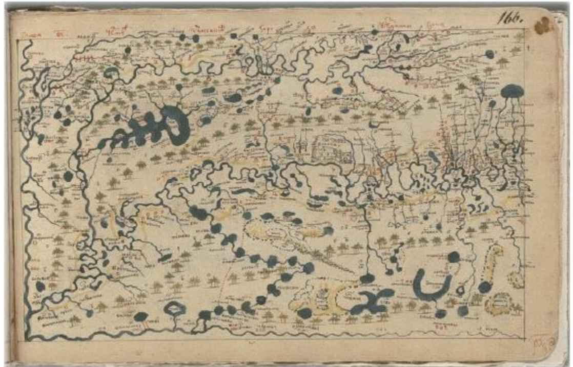
17 th century map of Urals, drawn by cartographer Semen Remezov

We are studying Russia as a part of Europe, while paying a special attention to the interaction of European cultural patterns with the unique factors, such as vast territory or multicultural and multiethnic environment.