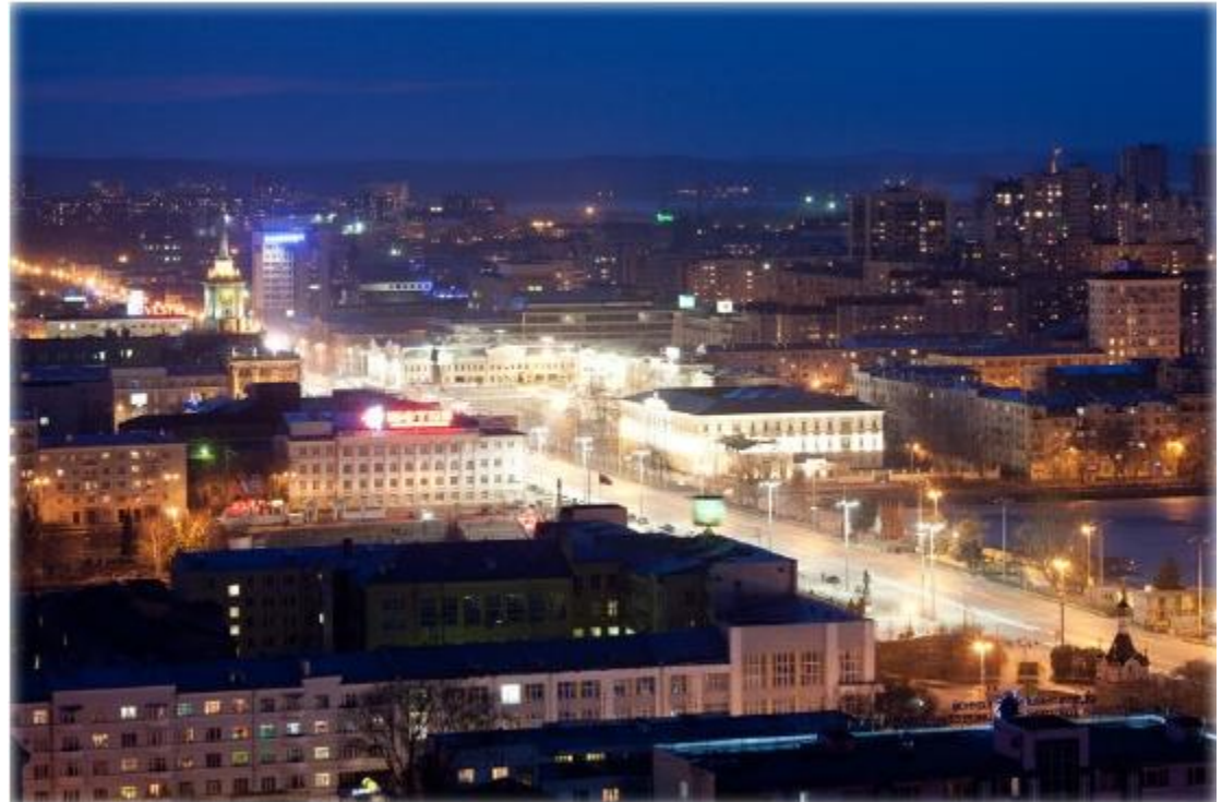
Central part of Ekaterinburg at night

Studying Russia in Ekaterinburg allows international student to get the understanding of 'Real Russia'. An old industrial region, a multicultural 'melting pot' on the border of Europe and Asia, Ural is providing an excellent practical addition to academic disciplines.