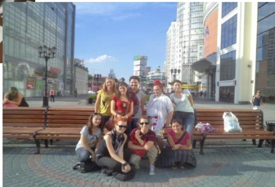
In the city (2012)