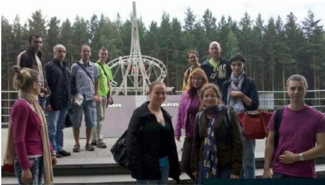
At the border of Europe and Asia (2011)