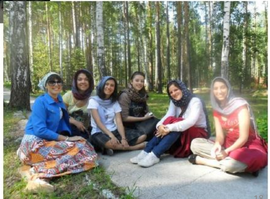
At the Ganina Yama – place where remains of the Nicolay Romanov were found,(2012)